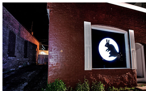
Art in Unexpected Places, City of Barrie, ON

Send to: Creative City Network of Canada - info@creativecity.ca