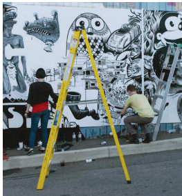
Hamilton Supercrawl Mural, by EN MASSE